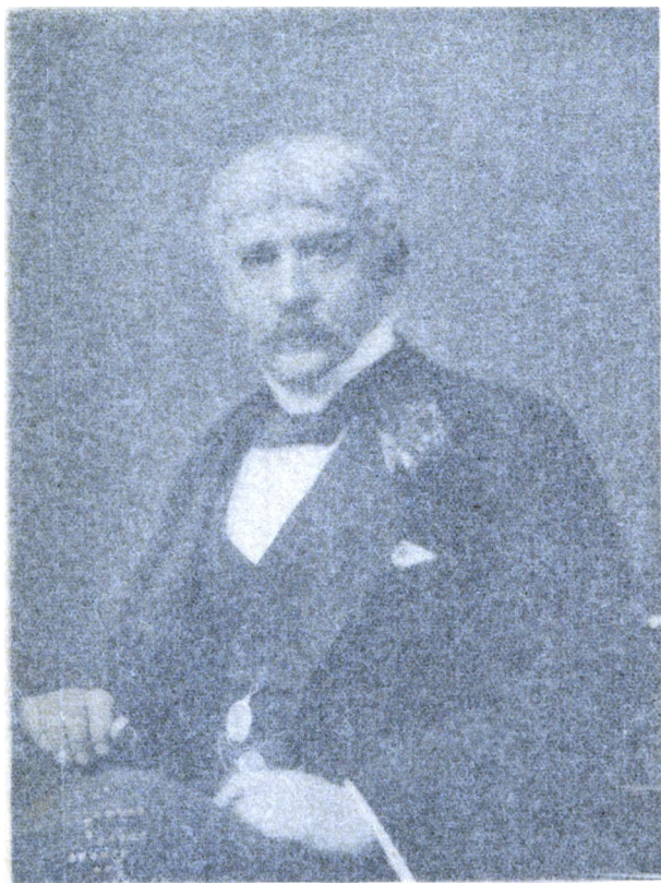
FRANCIS BRET HART